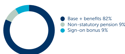
Total CEO pay in 2023 in proportions

The reward from the Global STI 2023 was based on Group EBITDA (Earnings before interest, taxes, depreciation, amortization, 70% weight), Group CM (Contribution margin, 20% weight), Group DSO+DIO (Days sales outstanding + days inventory outstanding, 10% weight) and personal targets (20% weight). The outcome for these targets in total was between threshold and target equaling to EUR 59,667.